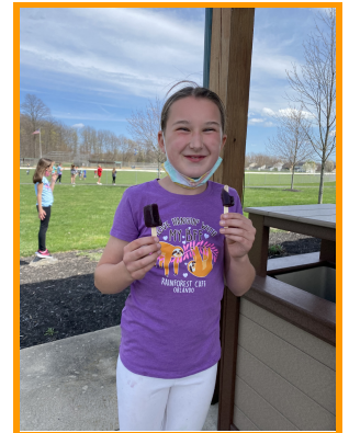
End of the day Friday fun with popsicles and kites!