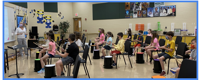
Bucket drumming in music!